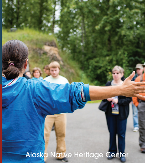
Alaska Native Heritage Center